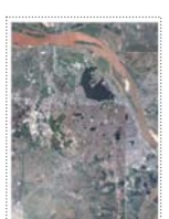
The Comprehensive Urban Development Programme in Hanoi Capital City, Vietnam