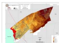
GIS for the Municipality of Angono, Rizal