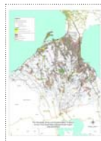
Cavite Laguna East-West Road Project