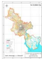
The Study on the Adjustment of the Ho Chi Minh City Master Plan, Vietnam