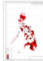
Natural Disaster Risk Management in the Philippines