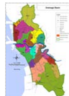
Drainage Improvement Plan in the Core Area of Metro Manila