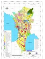
Metropolitan Manila Earthquake Impact Reduction Study