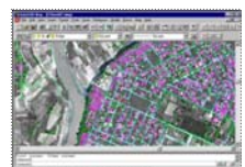
GIS for the City of Cabanatuan, Nueva Ecija